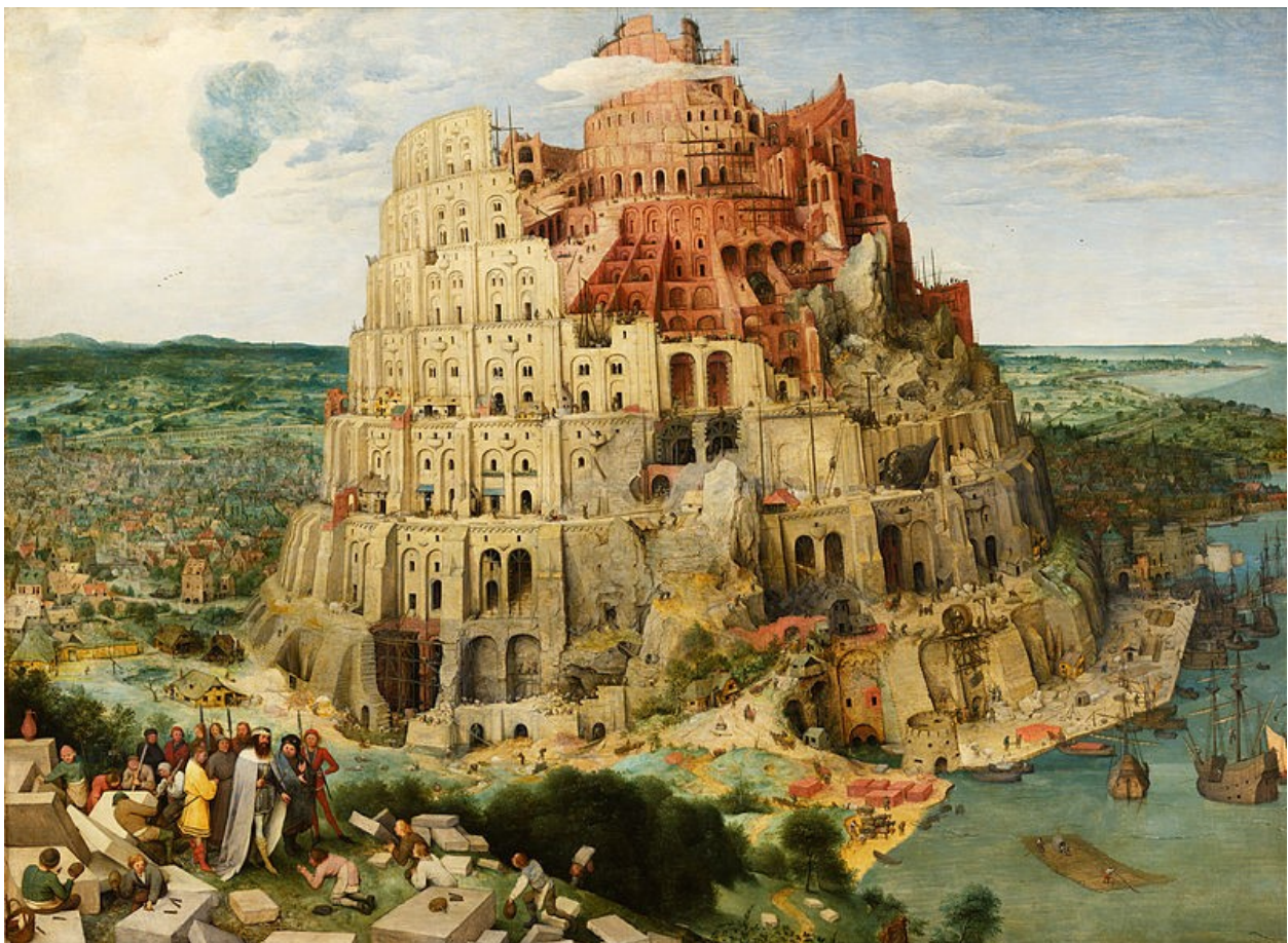
Pieter Bruegel the Elder, Tower of Babel . 1563. “So God scattered them from there over all the earth, and they stopped building the city.” Genesis 11: 8.