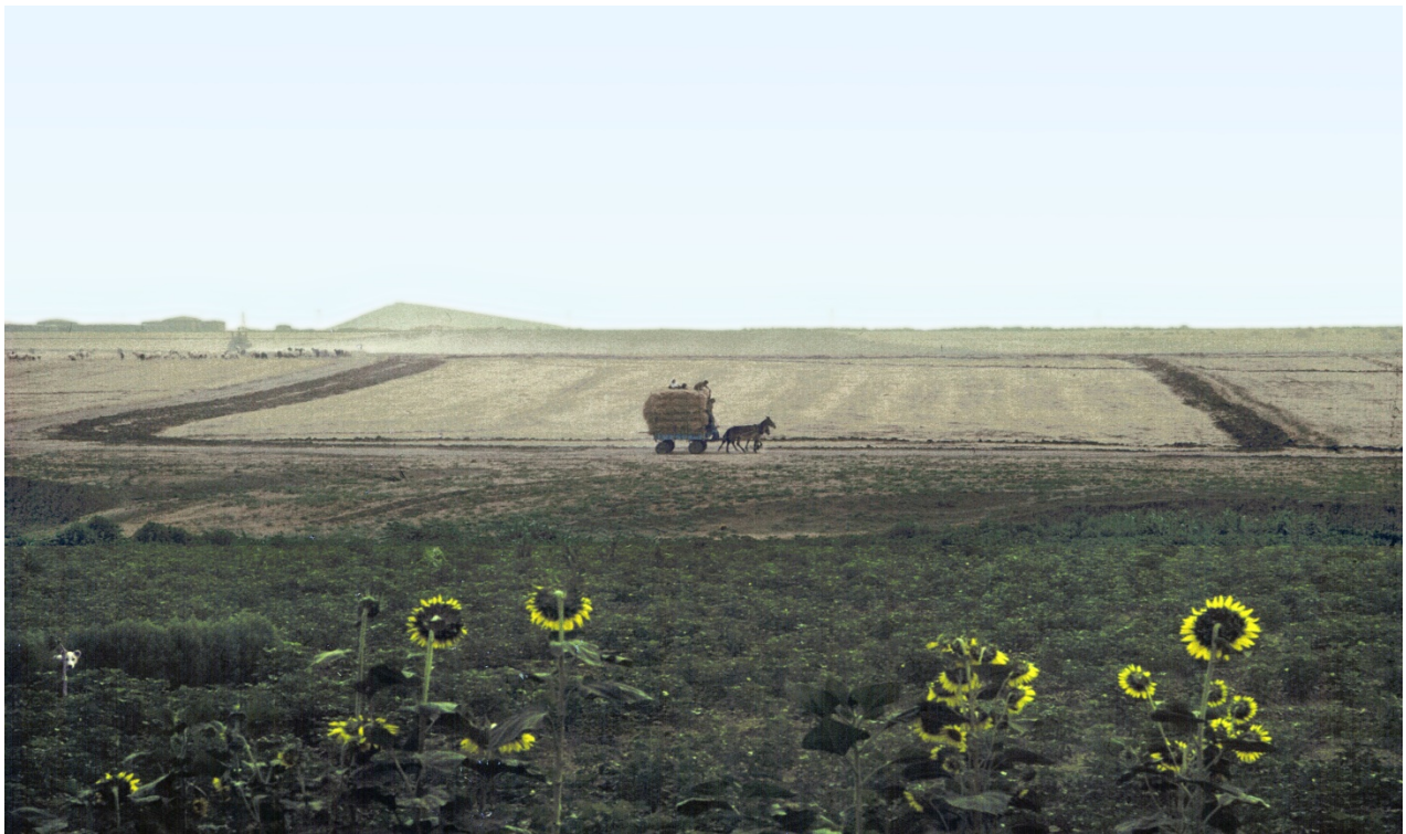
Northeast Syria, dry-farming harvest transport, view East from Tell ‘Aid (H. Weiss, July 1981).

The workshop is being structured as (1) pre-workshop reading of invitees’ suggested articles, (2) two or three workshop presentations each morning and afternoon, (3) each followed by Yale faculty participants’ analysis and discussion, (4) with a concluding summary discussion of outstanding issues and research problems.